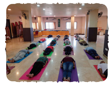
SMET Workshop - Privi Earth Ltd