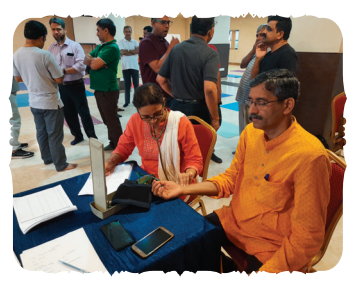
Pre workshop parameters check